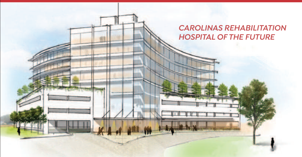
CAROLINAS REHABILITATION HOSPITAL OF THE FUTURE