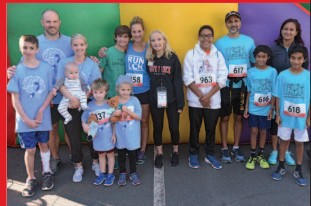
Grateful patient families and Levine Children's staff celebrate another successful Hopebuilders 5K!