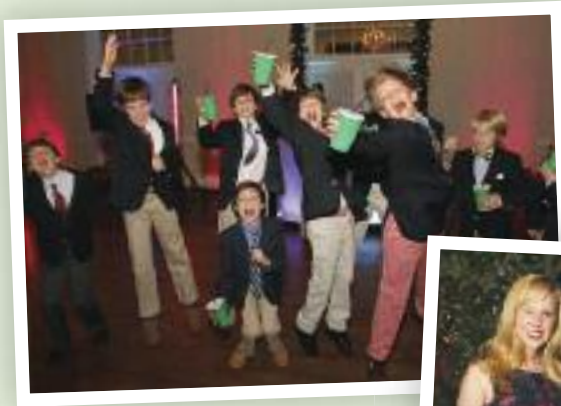
Above: A group of young men celebrate at the Nutcracker Ball.