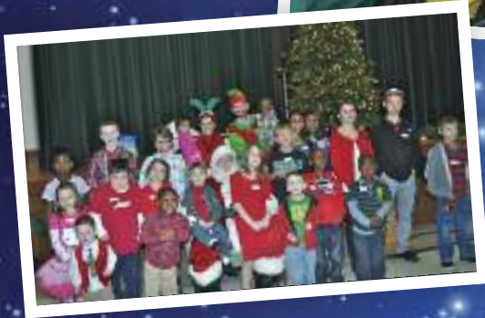
LCH patients gather around Santa at the 2nd annual LCH Holiday Transplant Party.

The Starlight Society's initial project involves funding the Center Stage Entertainment Series at LCH. Showcased in the Overcash Atrium, the series features special guests such as singers, actors, musicians, magicians, story-tellers, and more. Children unable to visit the atrium can watch the performances from their rooms on closed-circuit TV.