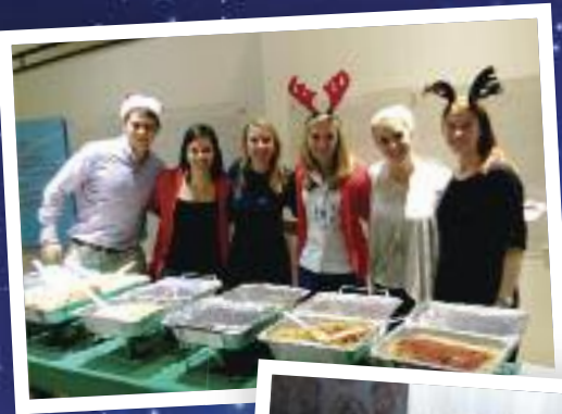
Starlight members served dinner and cheer at a holiday family dinner night at LCH.