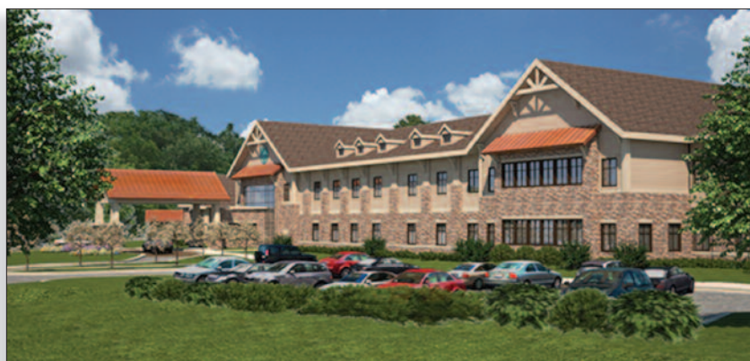
Architect's illustration shows the plan for Carolinas HealthCare System's new Davidson hospital, off NC 73.