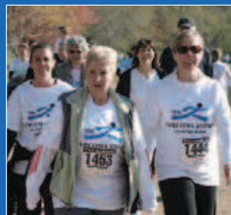
Race photographs by Nanine Hartzenbusch Photography, www.naninephoto.com