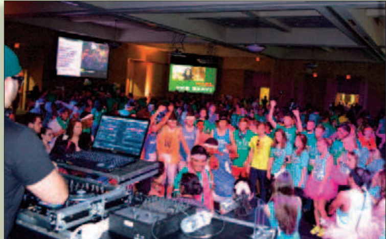
The UNC Charlotte 49ers dance the night away.

Each November students at UNC Charlotte celebrate the conclusion of a yearlong, campus wide fundraising effort for Levine Children's Hospital with a 12-hour dance marathon. More than 600 "Charlotte 49ers" danced the night away at the 2nd Annual Charlotte Dance Marathon, which raised over $49,000. Dance Marathon is a nationwide movement at more than 250 colleges and universities in support of Children's Miracle Network Hospitals. This student-run philanthropic event uniquely unites the UNC Charlotte student body with the Charlotte community and fosters a collective commitment to Levine Children's Hospital. We thank UNC Charlotte students for honoring families from Levine Children's Hospital by participating in this wonderful cause!